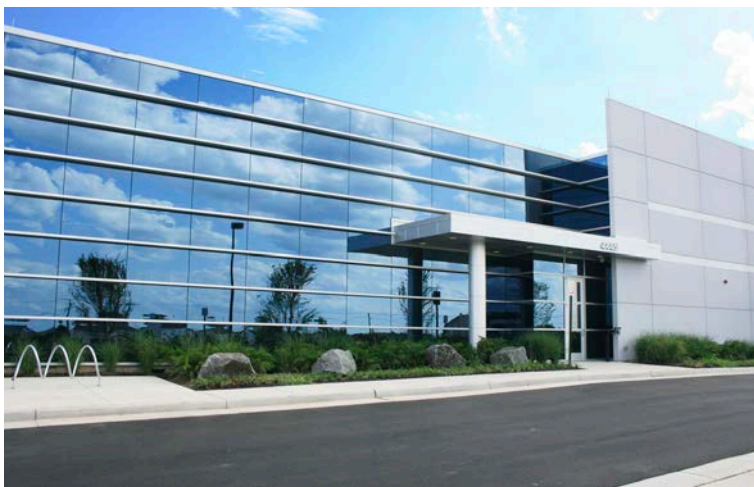
Building ACC6, part of the Ashburn Corporate Technology Center, is 300,000 square feet and located just outside of Washington D.C.

Data centers critically manage airflow in and out of a facility to balance air levels and reduce energy costs. Pottorff offers the preferred products to meet these high demands for ventilation control and reduced energy consumption.