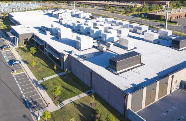
Overview of the Ashburn Corporate Data Center campus in Ashburn, VA.

Data centers are facilities that provide shared and highly secured access to applications and data.