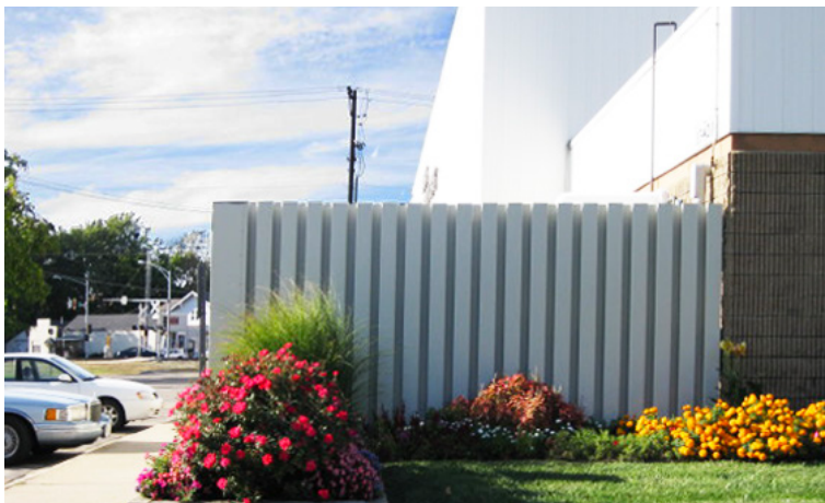
Data centers house computing and networking equipment for firms to allow secure access to large amounts of data.