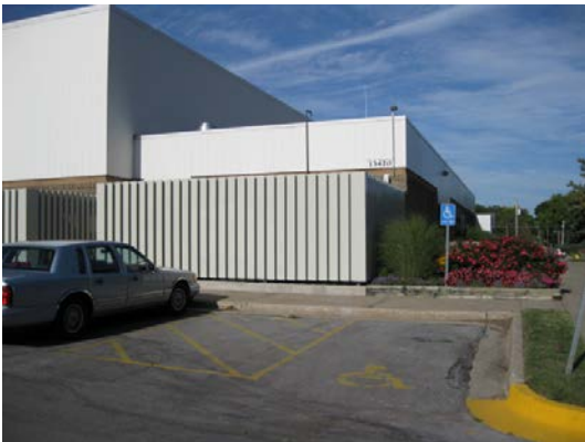
Vertical sight screen around HVAC equipment.

Louvers and screens available in a wide array of finishes including custom color matching.