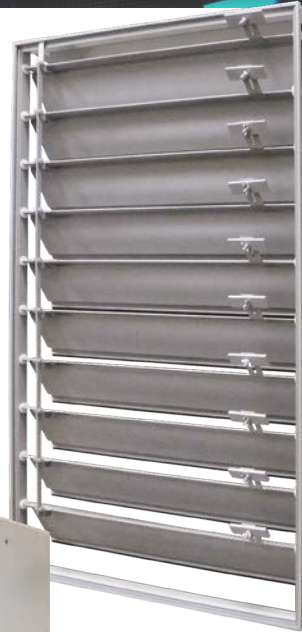
Counterbalanced Gravity Operated Blades